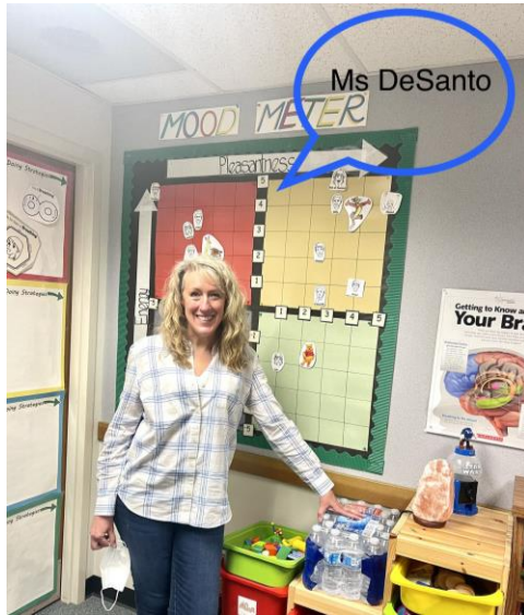
Elementary Support Specialist