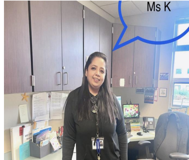
Family Engagement Liaison