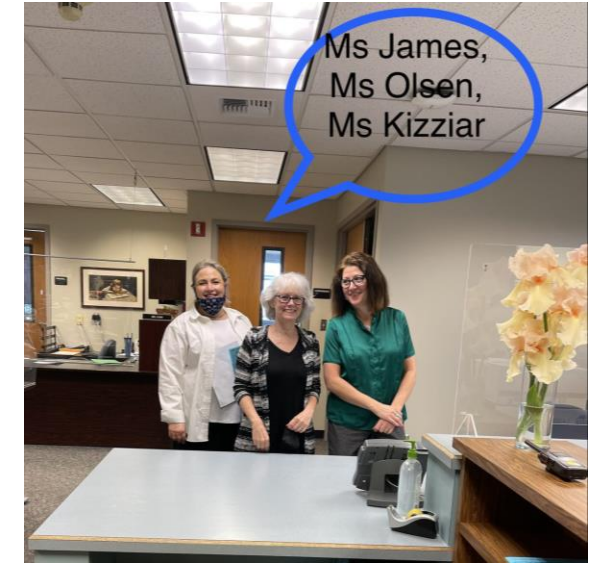
Attendance, Administrative Asst., Registrar