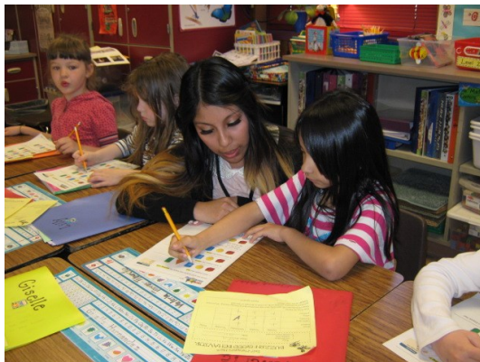
Careers In Education

Mukilteo School District's Career and Technical Education (CTE) programs strive to provide authentic learning experiences that prepare students to be Career and College Ready in the 21st Century. CTE empowers students to be strong leaders, workers and citizens through hands-on opportunities in and out of the classroom.